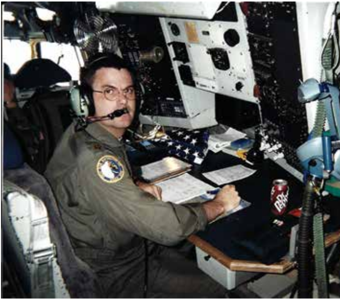
Working at the navigator table in a KC-135R Stratotanker during a flight.