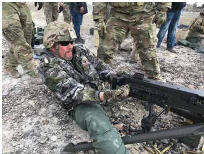
Soldiers from the 222nd Field Artillery Battalion demonstrate the 50-caliber M2 machine gun to a group of civilian employers at a Boss Lift, April 23, 2022, at Dugway Proving Ground, Utah.