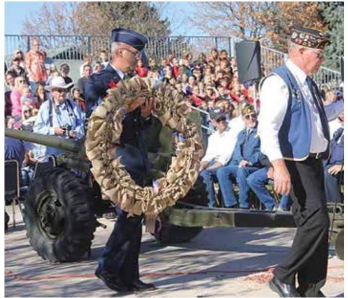
Laying a wreath at the Veteran's Day program in Castle Dale, Utah in 2016.