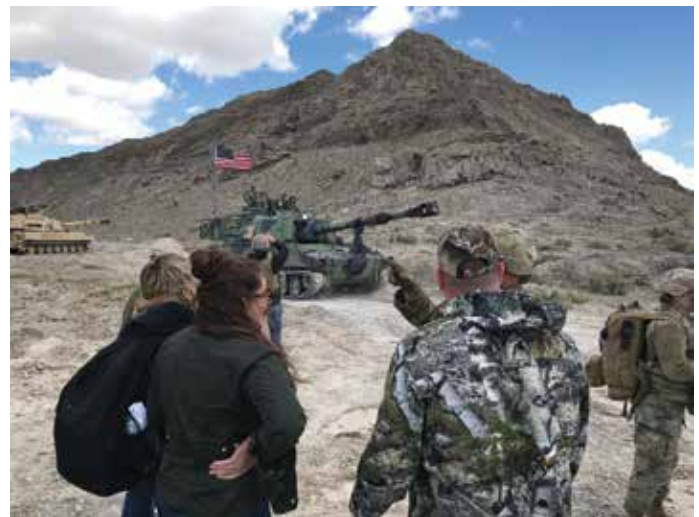
Soldiers from the 222nd Field Artillery Battalion demonstrate the capabilities of their M109A6 Paladin, a self-propelled artillery vehicle, to a group of civilian employers at a Boss Lift, April 23, 2022, at Dugway Proving Ground, Utah.

To nominate your employer for a Patriot Award visit the ESGR website at esgr.mil . 🇺🇸